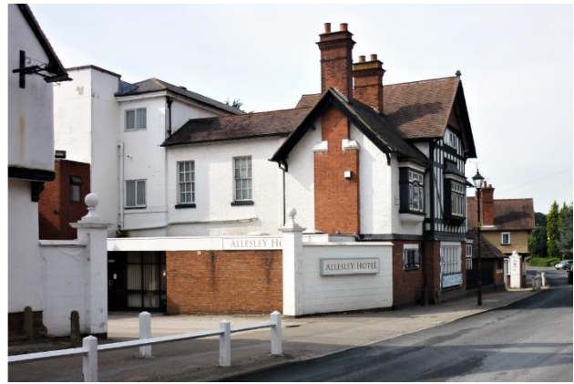
Figure 2. Allesley Hotel 2022